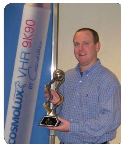
The highly-popular CosmoLux VHR 9K90 sunlamp – winner of multiple ist Magazine Industry Choice Awards – utilizes a revolutionary and patented phosphor blend that set new industry standards for quality, useful life and tanning results.

Over the years, engineers at Cosmedico have established the company’s reputation for producing high-quality sunlamps. As a result, names such as CosmoLux, CosmoStar and HI-TAN continue to ☺